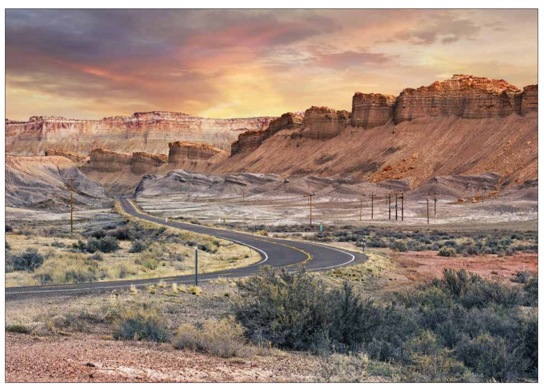
Capitol Reef National Park from Scenic Byway 12 in Utah

The 1,700-mile, all-paved highway is one of the most visited motorcycle destinations in the country. Riders travel along with breathtaking views of the