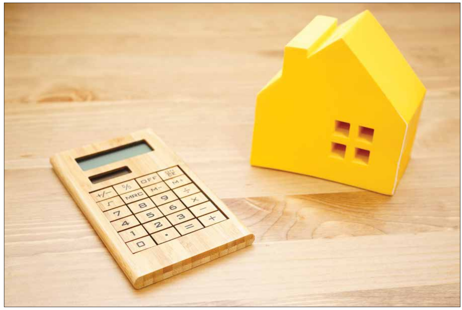
D ADOBE STOCK