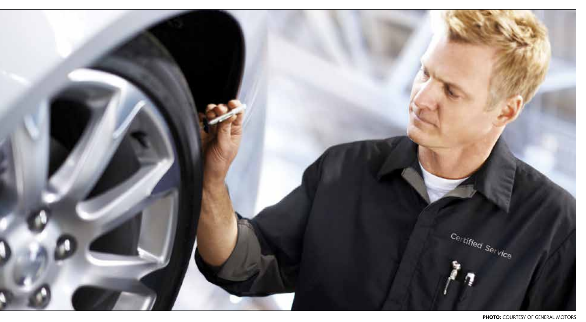
The most important part of any certified used-car program is its inspection, something that varies with each manufacturer.

a complete copy of the inspection report. The paperwork should tell you who performed the inspection, when it was done, what things were checked, along with the condition or status of each item on the checklist.