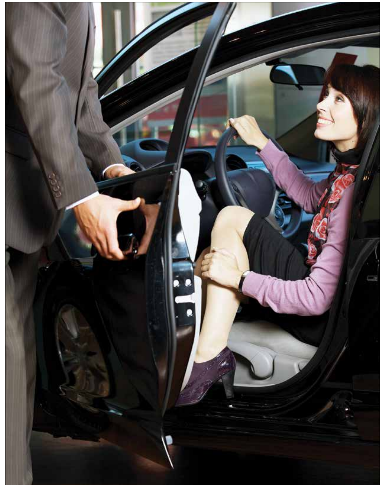
doesn't hurt to ask, especially if you've already got a good relationship with In case you change your mind, a few certified used-car programs will let you exchange a car after you've already purchased it. Be aware of the limitations, though.

Some dealers have been known to let their most trusted customers keep a car for an afternoon, or even overnight, to evaluate it. This is rare, but it the dealer.