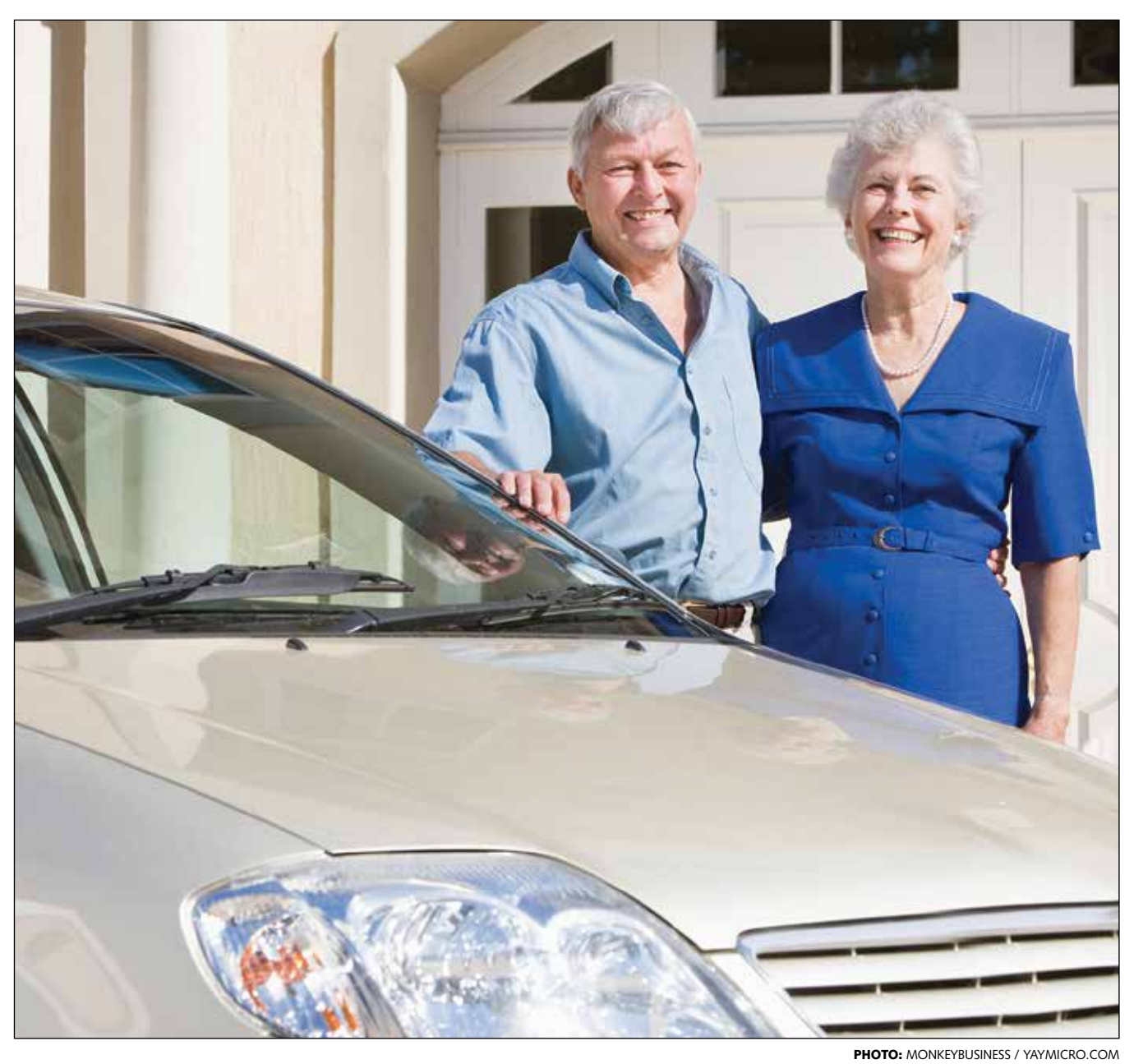
Choosing a certified used car makes the purchase process simpler and more worry-free.

By shopping around for the best certification program with the best warranty, as well as the best vehicle, you'll have what every car buyer wants: the comfort of knowing you made a smart decision.