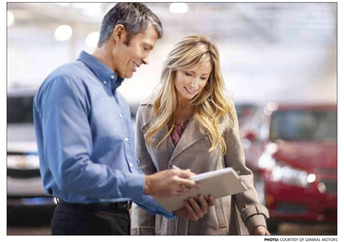
Certified pre-owned car programs aim to minimize the difference between new and used vehicles.

By getting a car that's already been inspected and professionally repaired, you're saving money and trouble down the road.