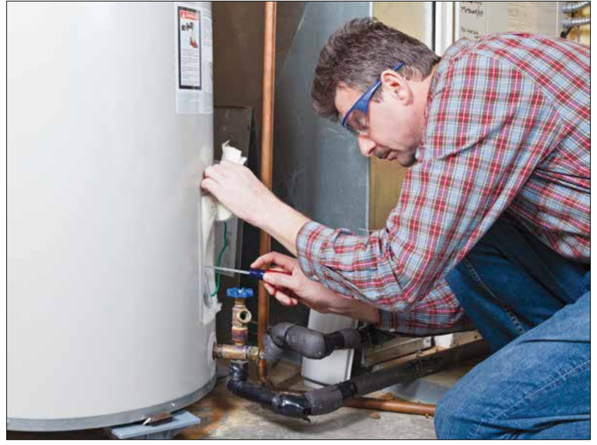
Don't forget the costs of routine home maintenance — including maintaining your plumbing and air conditioning systems and roof — when you're budgeting for a new

The types of pests you may find in your home vary greatly by region and