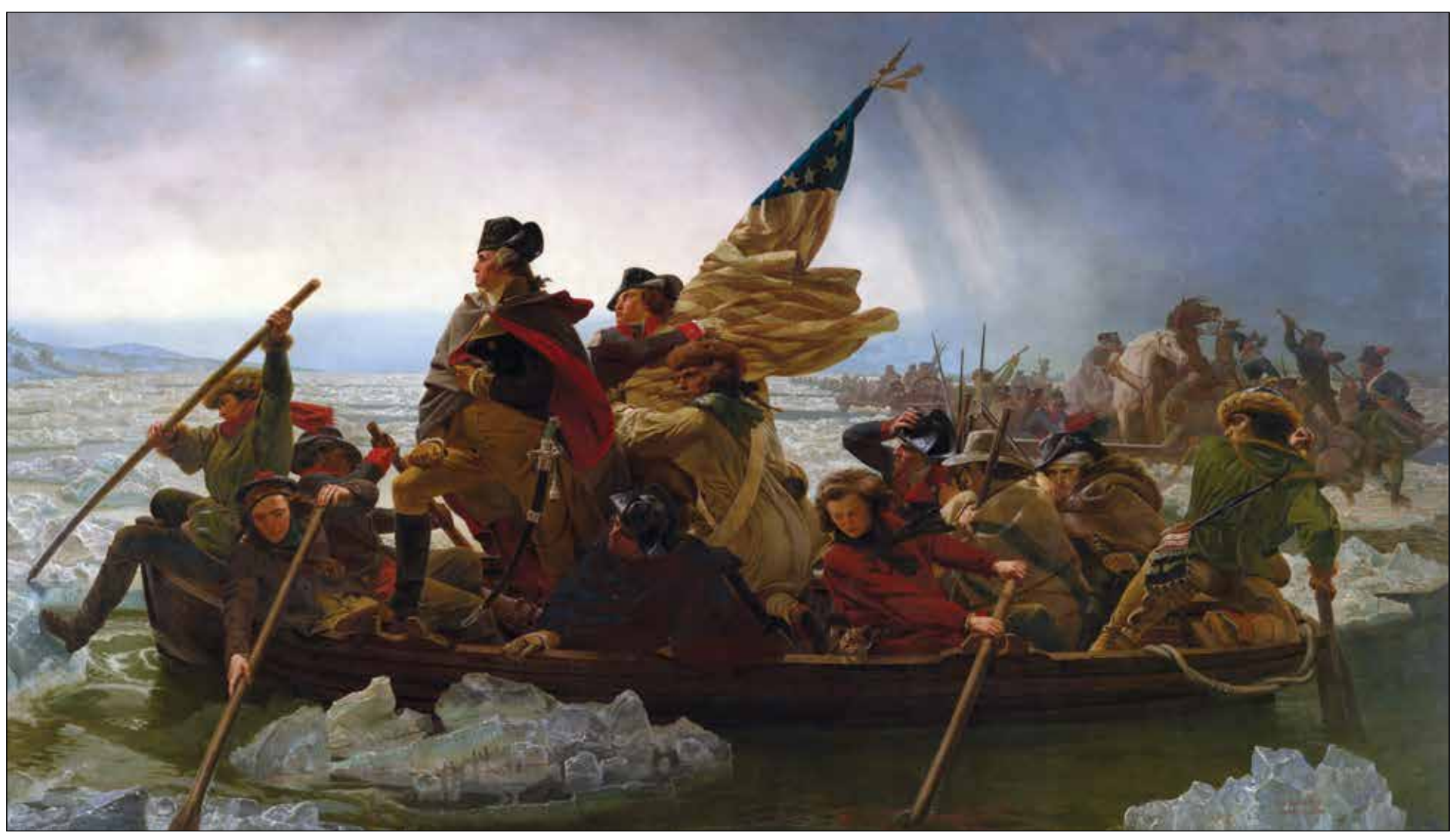
EMANUEL LEUTZE