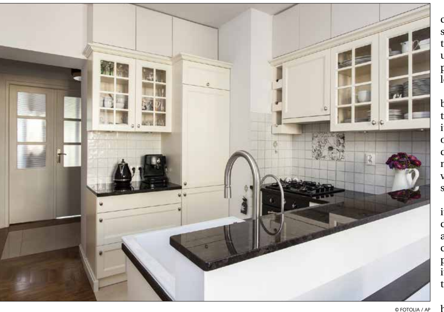
Quartz countertops have the look of natural stone but are typically more resistant to staining.

Quartz countertops also come in a wide variety of col-